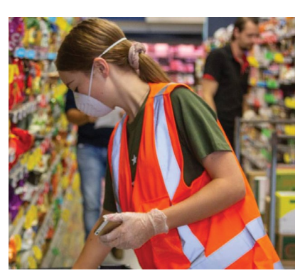
VUW STUDENT VOLUNTEER ARMY – SHOPPING AID

Planning for the Victoria University Corporate Challenge event for 2020 is proceeding. The awards during National Volunteer week